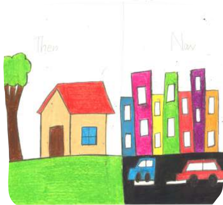
Harshyl Sudharshan - Grade 6