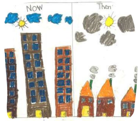
Ayush Mukherjee - Grade 4