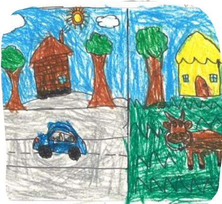
Vedant Nimbolkar - Grade 3