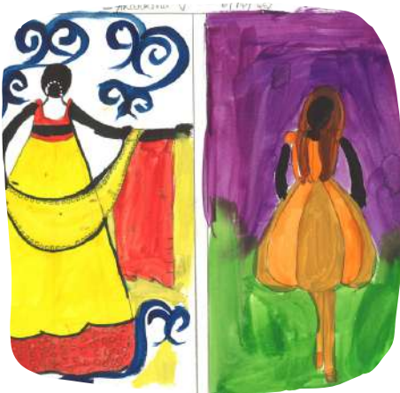
Akanksha Visweswaran - Grade 7