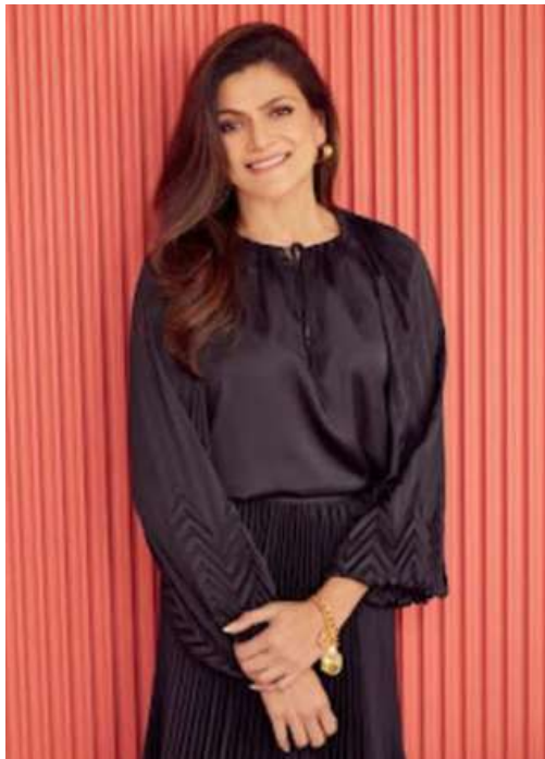
Mrs. Neerja Birla Chairperson